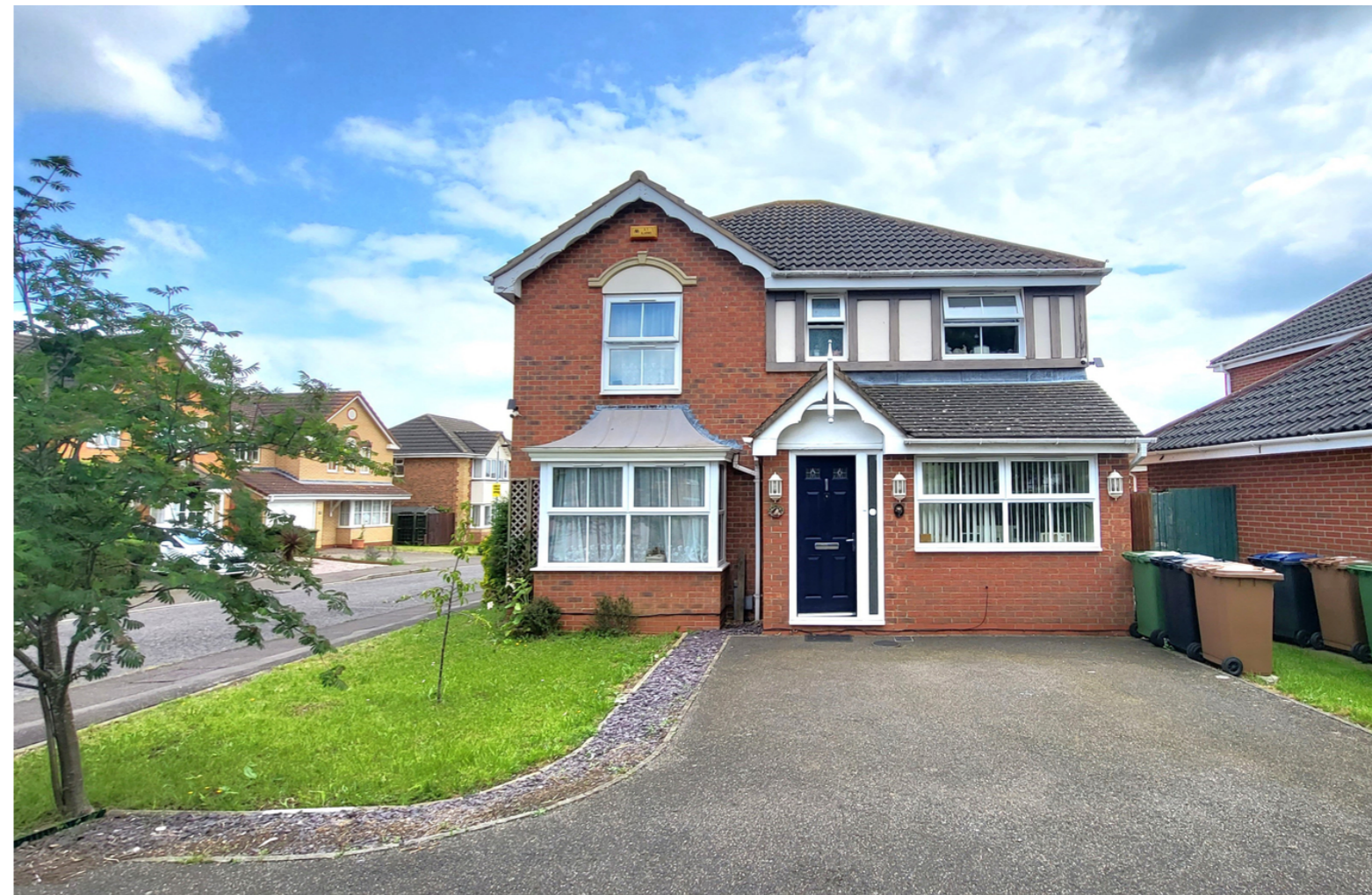
2 Framlingham Road, Park Farm PE2 8UF