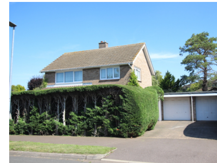
3 Cambridge Way, Langford, Bedfordshire, SG18 9SG