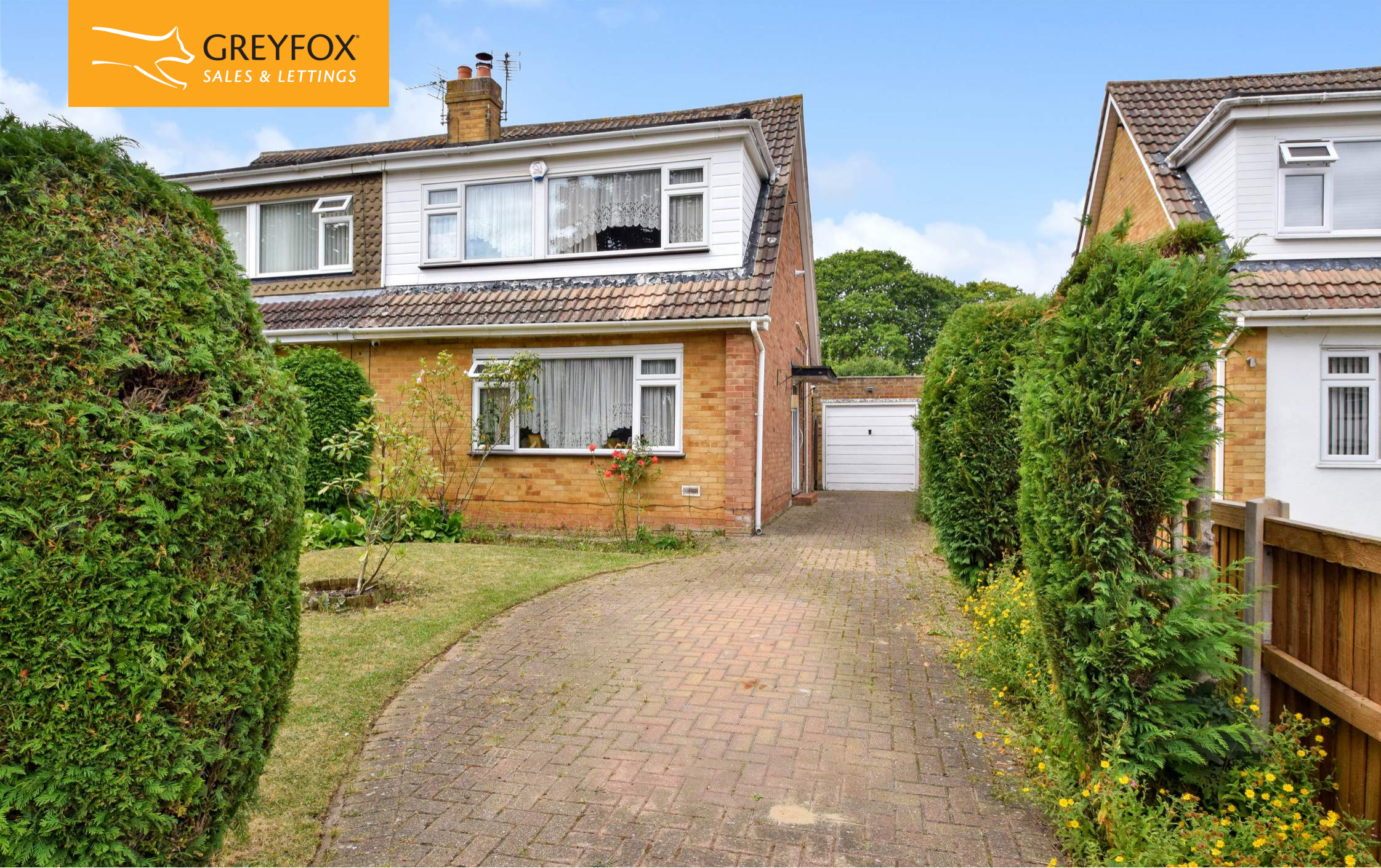
Three Bedroom Semi-Detached House Courtfield Avenue, Lordswood, Chatham, Kent, ME5 8QR