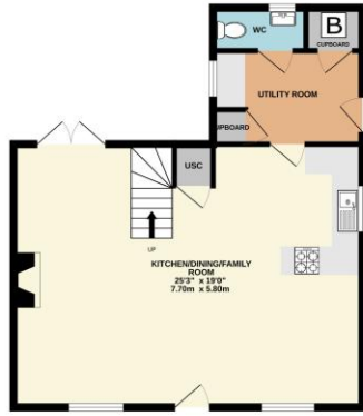
GROUND FLOOR 581 sq.ft. (53.9 sq.m.) approx.