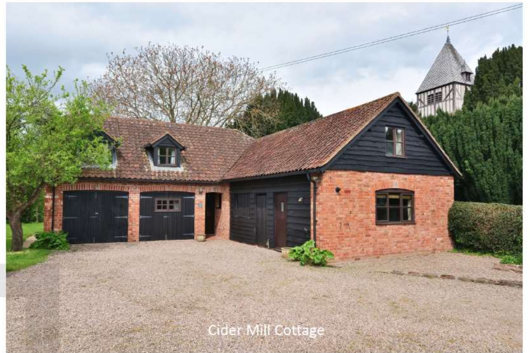
Cider Mill Cottage