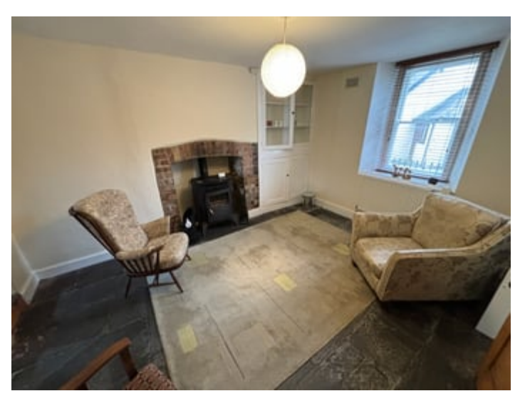
15' 3" x 11' 10" (4.65m x 3.61m). A characterful living area with a brick open fireplace housing a multi fuel stove having a back boiler for the heating system throughout the property, understairs storage cupboard with the electrical heating system, fitted glazed cupboards.