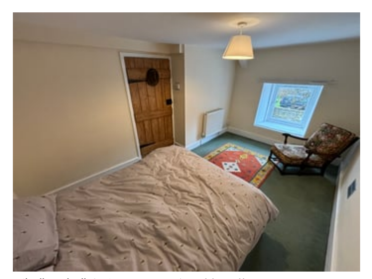
15' 0" x 9' 6" (4.57m x 2.90m). With radiator.