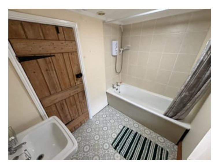
With a panelled bath with shower over, pedestal wash hand basin, w.c., part tiled walls.