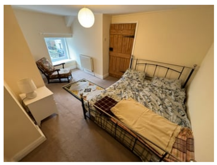
15' 0" x 11' 0" (4.57m x 3.35m). With built-in airing cupboard housing the copper cylinder, radiator.