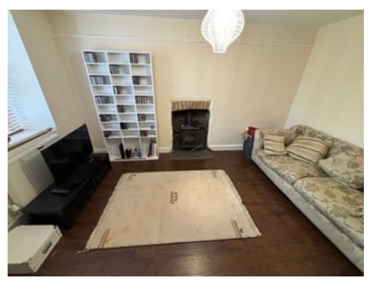
15' 3" x 9' 6" (4.65m x 2.90m). With an open fireplace housing a wood burning stove, timber effect flooring, radiator.