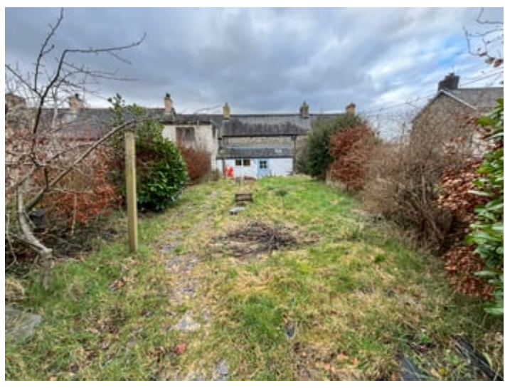
To the rear lies a generous and attractive garden area with a large paved patio with steps leading onto level lawned areas with various outhouses/garden sheds to the rear.