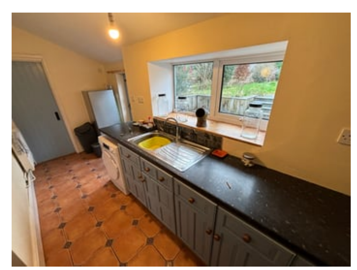
16' 0" x 5' 0" (4.88m x 1.52m). A galley style Kitchen with a range of wall and floor units with work surfaces over, stainless steel sink and drainer unit, space for cooker and dishwasher, rear entrance door.