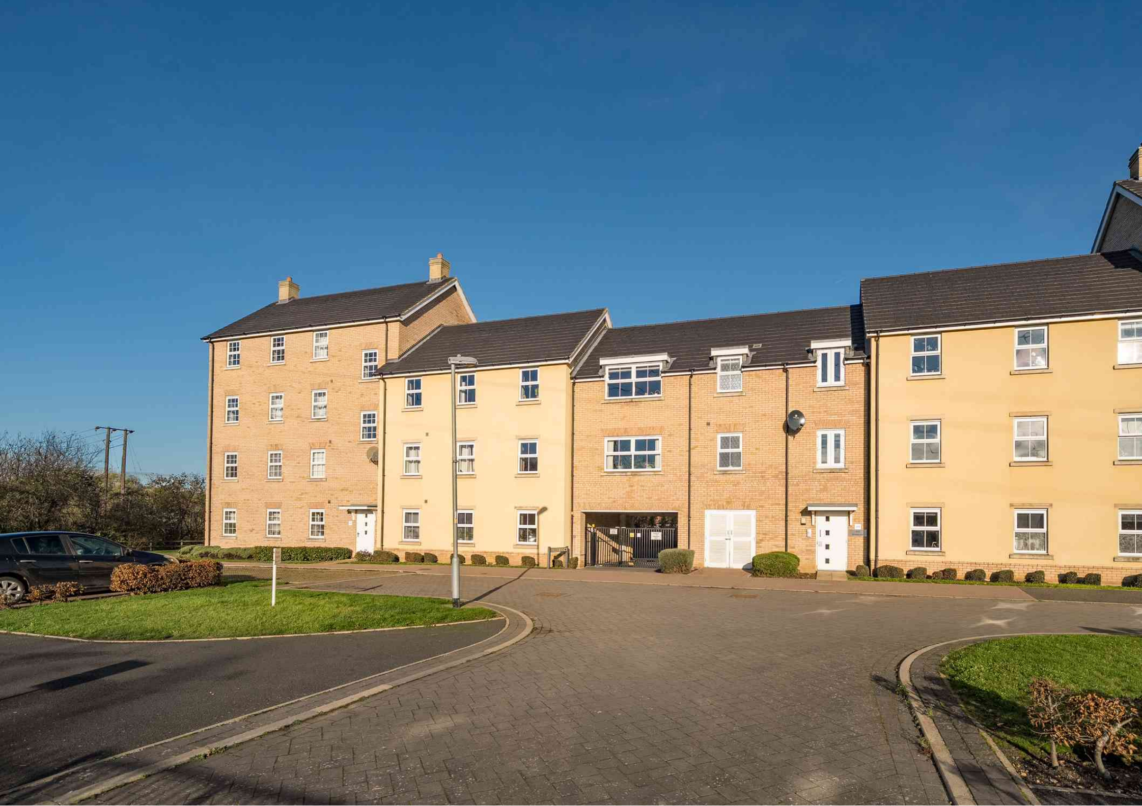
Delphinium Court, Eynesbury, St. Neots, PE19 Approximate Area = 558 sq ft / 51.8 sq m For identification only - Not to scale