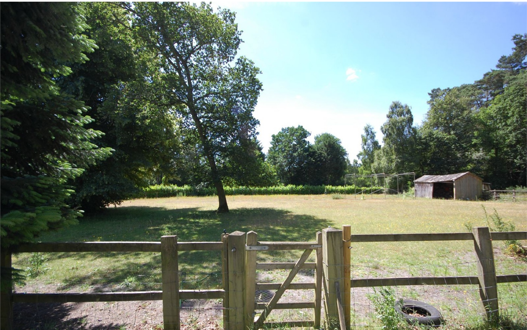
The Firs, Eglinton Road, Rushmoor, Tilford, Farnham, Surrey. GU10 2DH. Guide Price £1,450,000