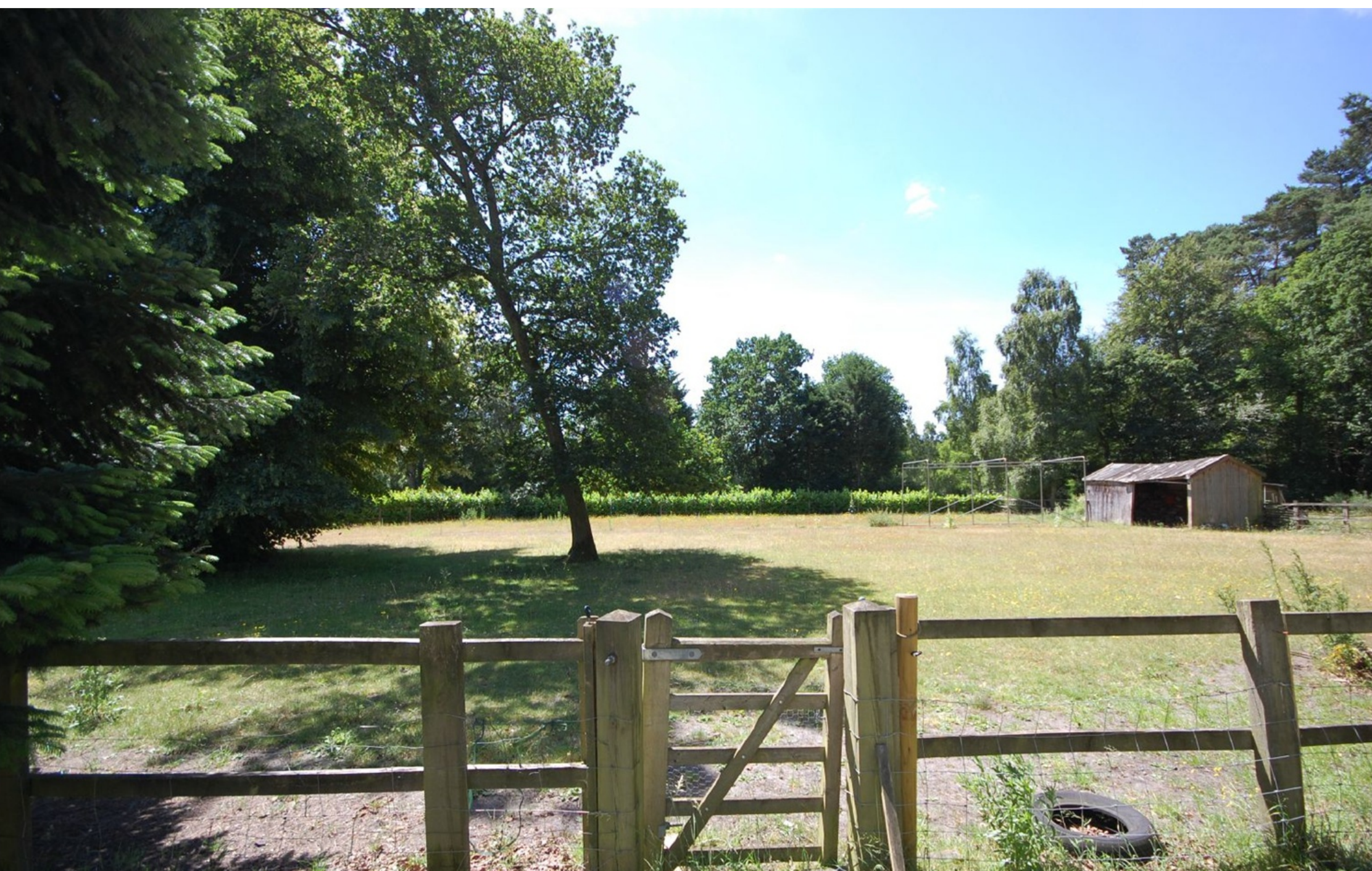
The Firs, Eglinton Road, Rushmoor, Tilford, Farnham, Surrey. GU10 2DH. Guide Price £1,450,000