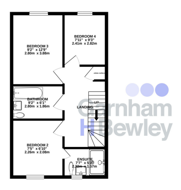
2ND FLOOR 403 sq.ft. (37.4 sq.m.) approx