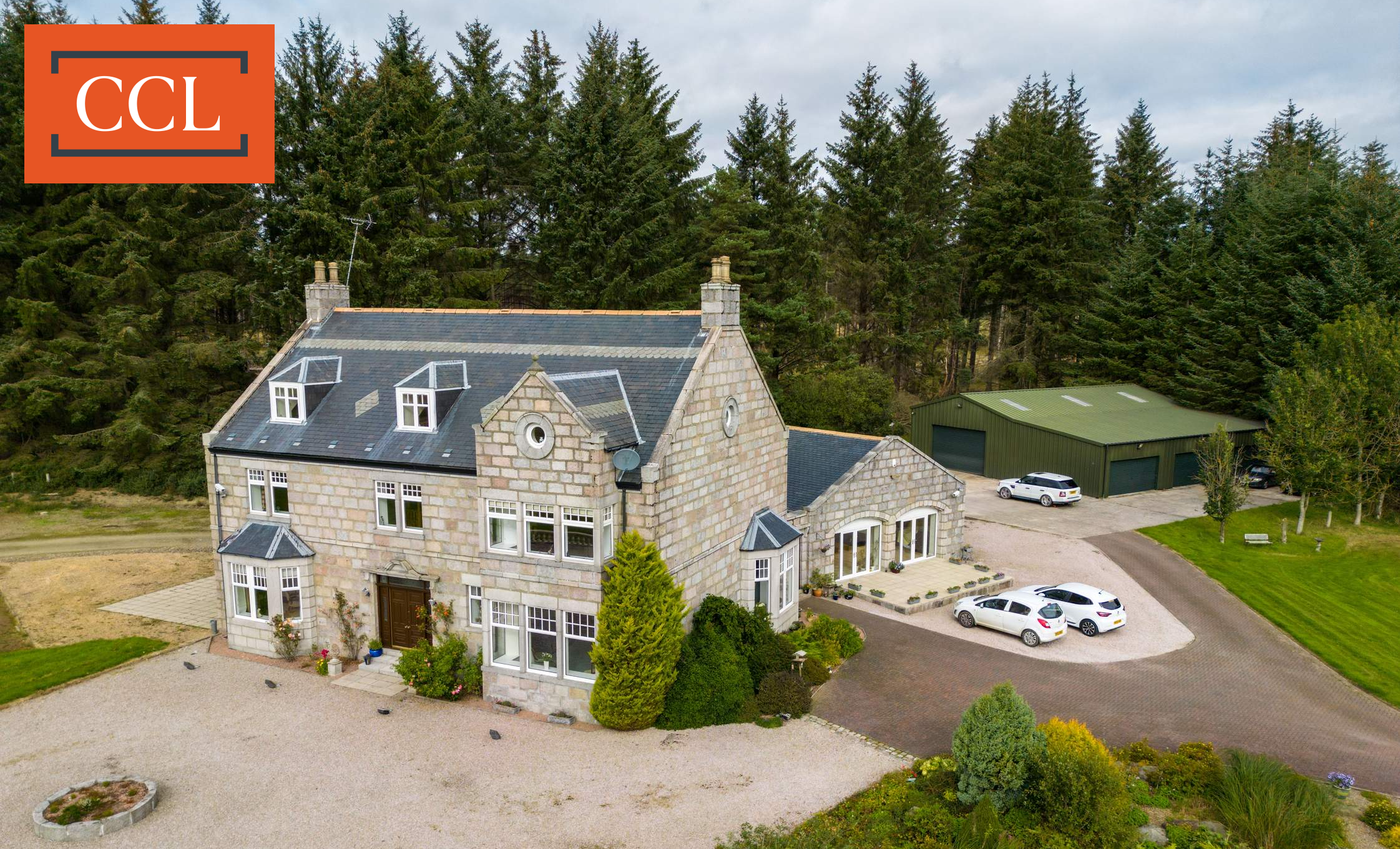
Canterbury House | Cornhill | Banff | Aberdeenshire | AB45 2BP