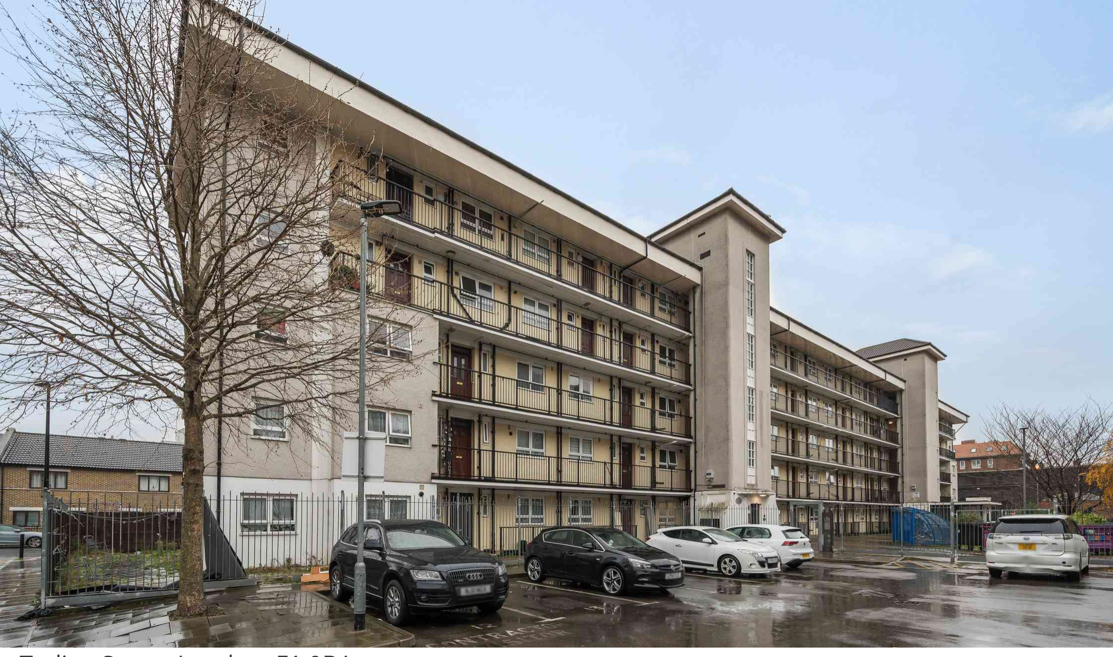
Tarling Street, London, E1 0BA