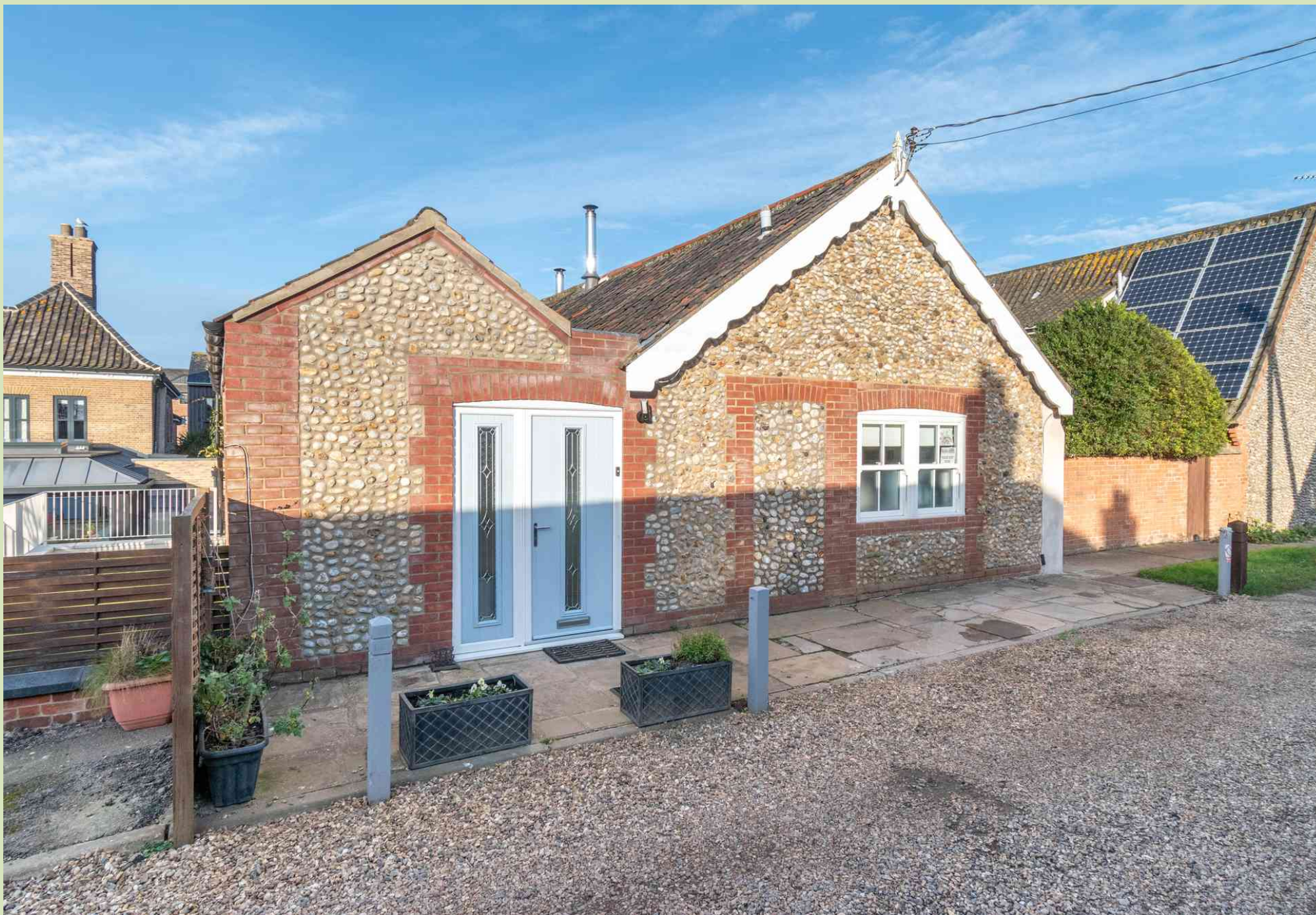
1-3 Barn Cottages, Wells-next-the-Sea Guide Price £699,950