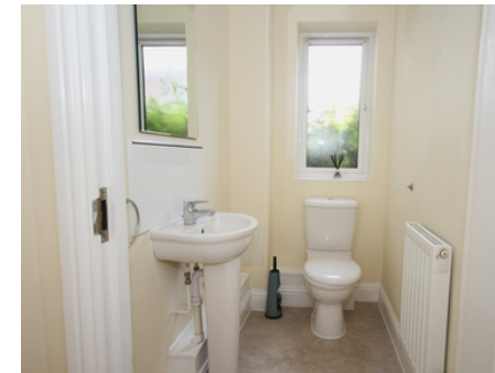
51 Principal Court, Letchworth Garden City, Hertfordshire, SG6 1FL