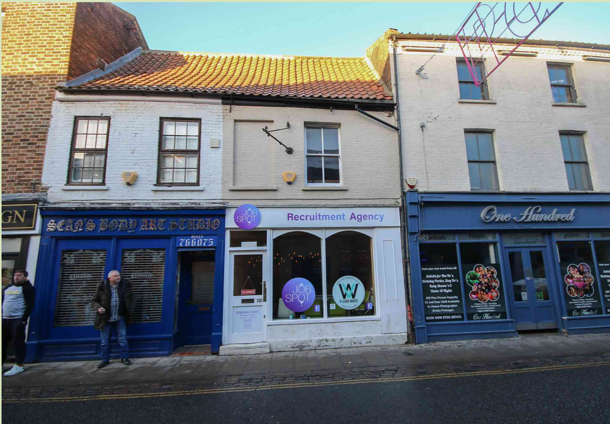
101 Norfolk Street, King's Lynn Guide Price £130,000