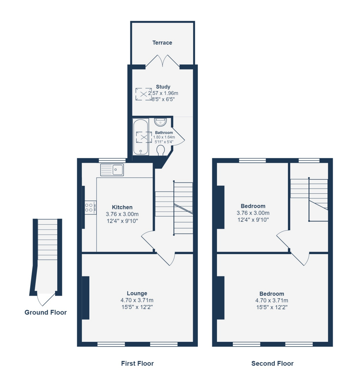
Total Area: 83.9 m<sup>2</sup> ... 903 ft<sup>2</sup> (excluding terrace)

Drawn for Stanfords Sales & Lettings This floorplan is for illustrative purposes only. Whilst every effort has been made to ensure the accuracy of the plan, the dimensions and total area are approximated only and should not be relied upon.