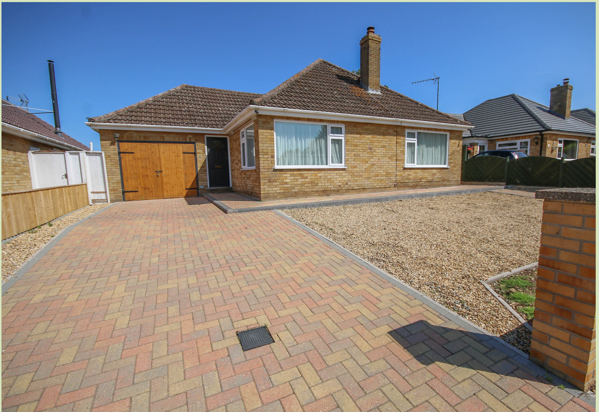
5 Watering Lane, West Winch Guide Price £279,950