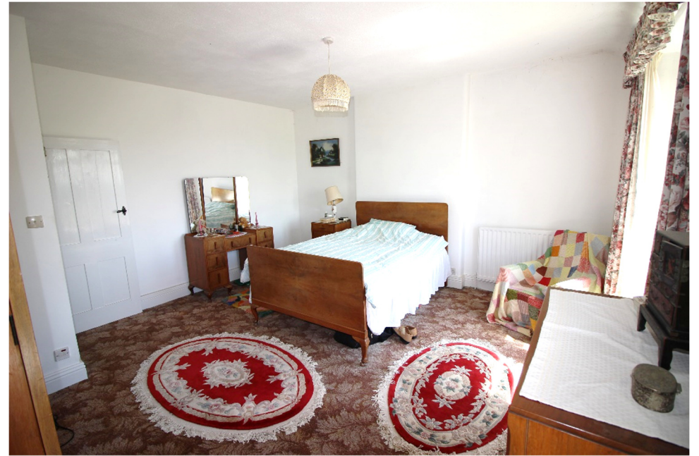
Farmhouse bedroom 1