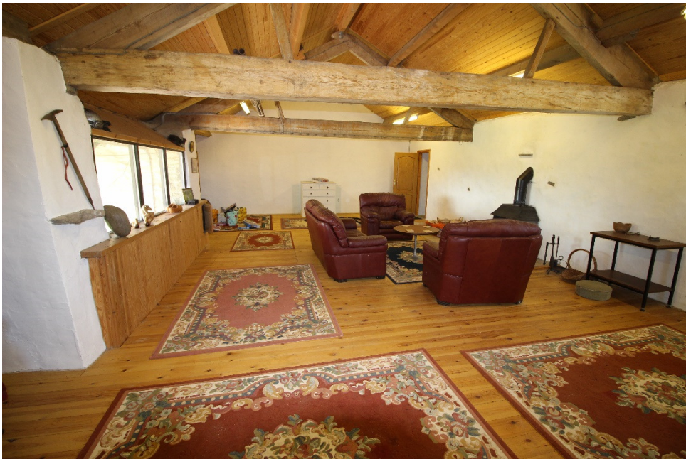
Barn entertaining room