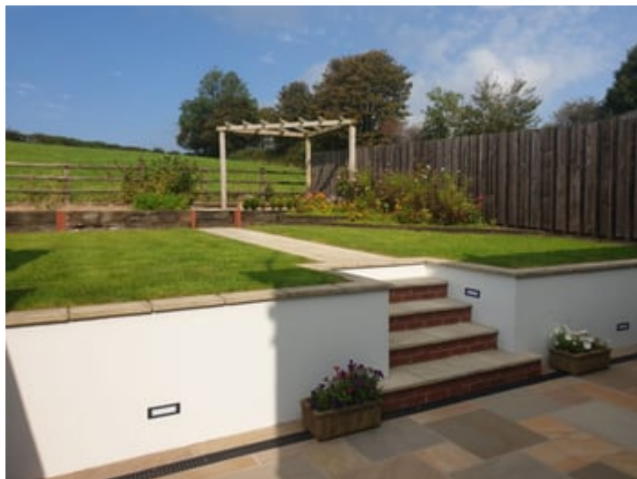
GARDEN (FOURTH IMAGE)