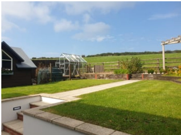
GARDEN (SECOND IMAGE)

To the side of the property lies a lawned garden area that sweeps onto the front porch.