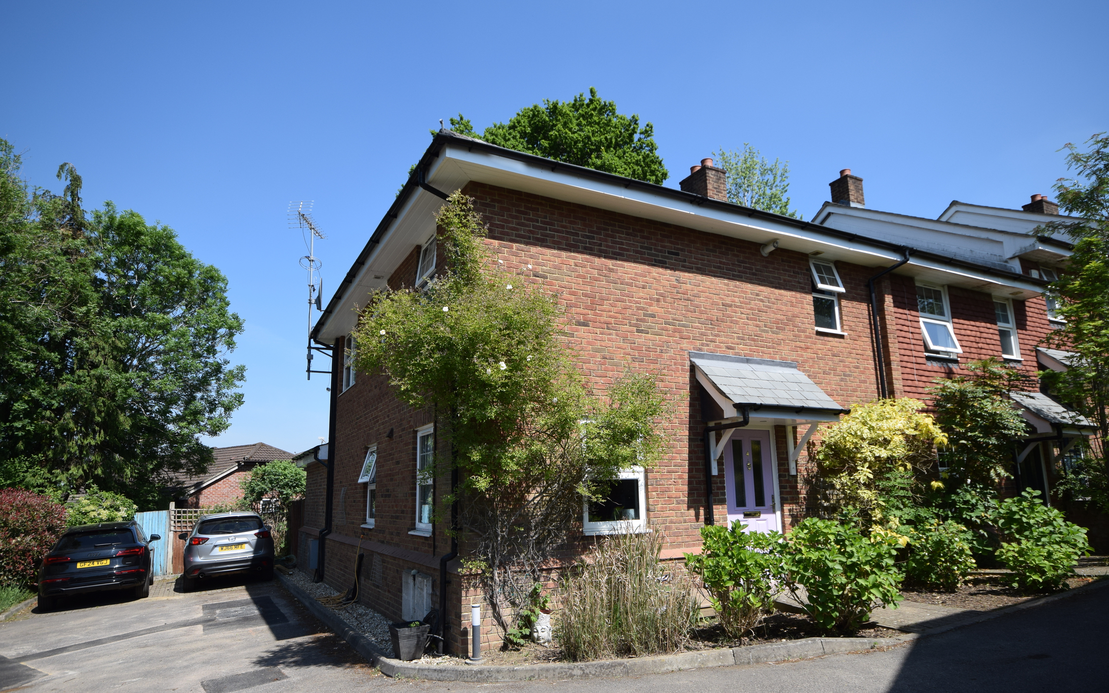
4 Thistledown Close, Wrecclesham, Farnham, Surrey. GU10 4AG. Guide Price £550,000