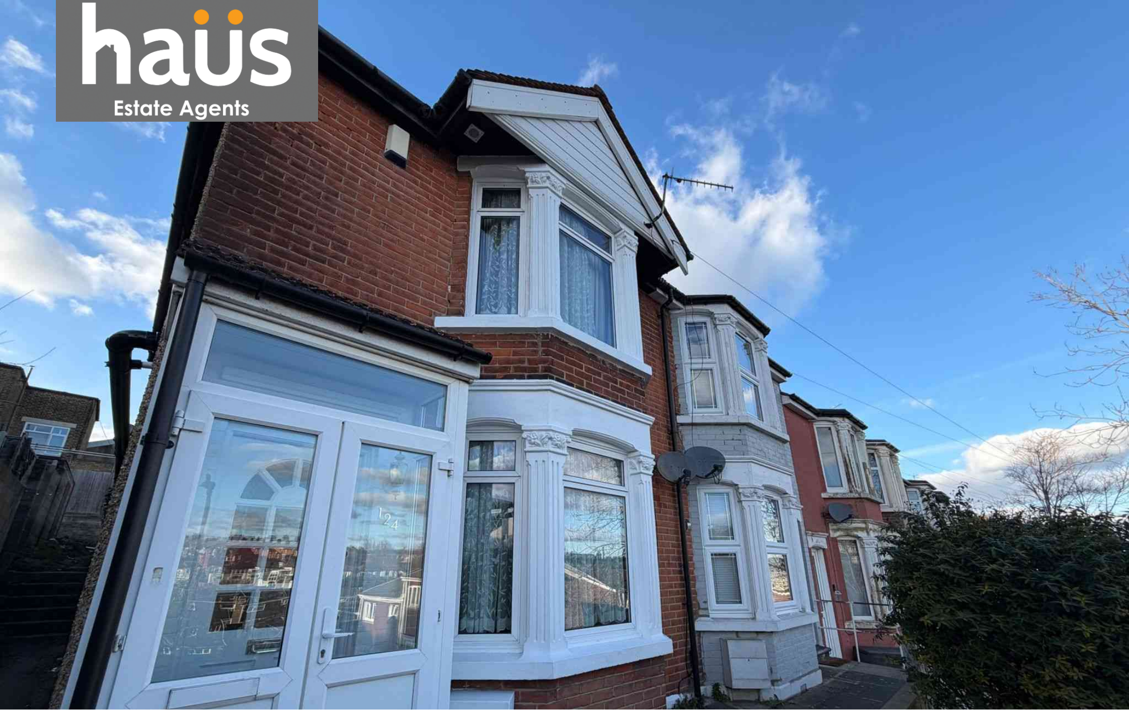
Three Bedroom Terraced House Mount Road, Chatham, Kent, ME4 5RR