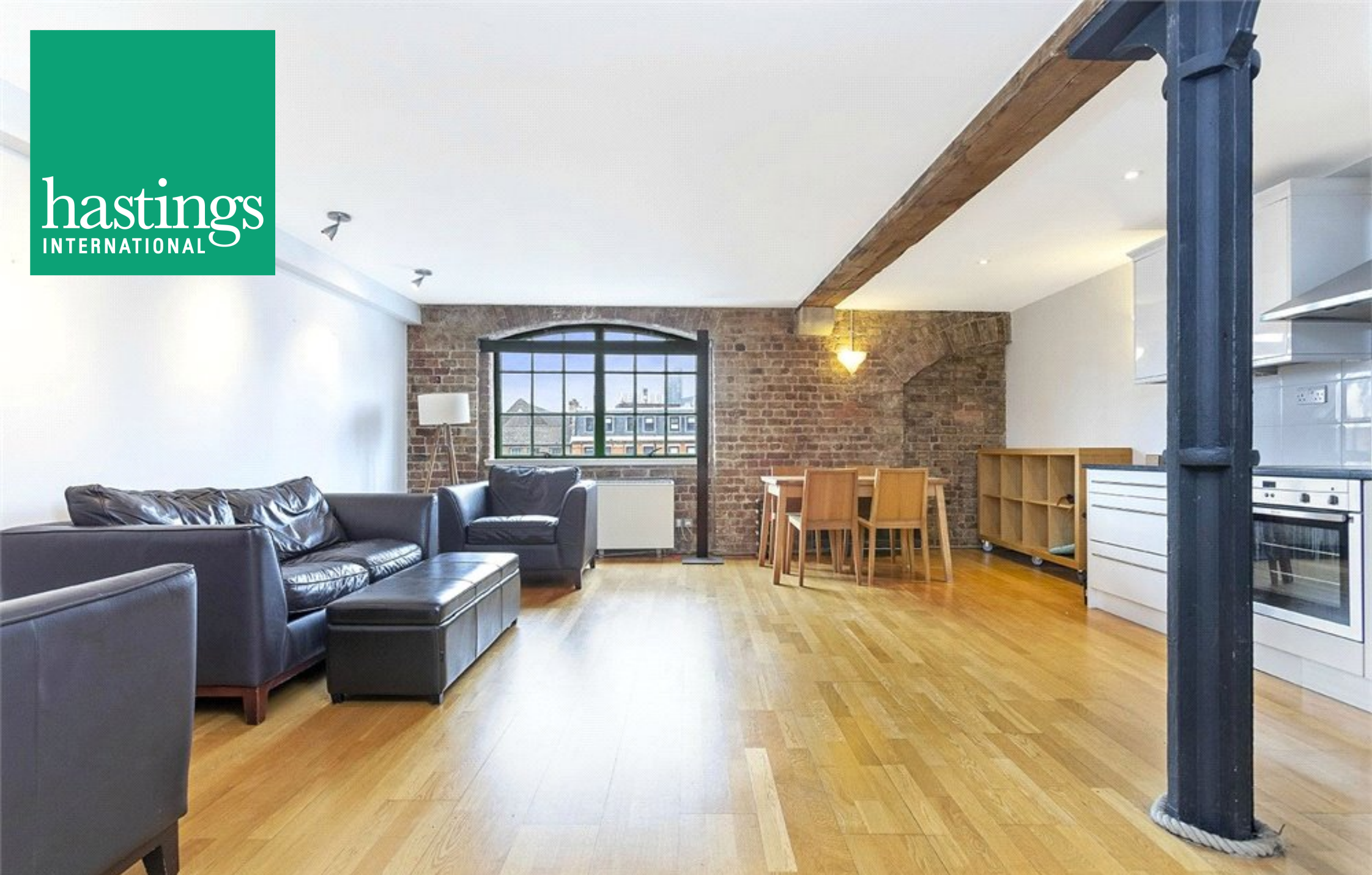
2 Maidstone Building Mews