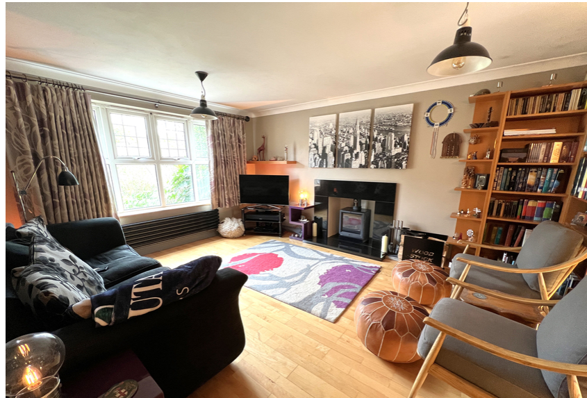
South facing private garden

An executive four bedroom detached property situated within this sought after location | Modern kitchen with built in appliances | Double garage |