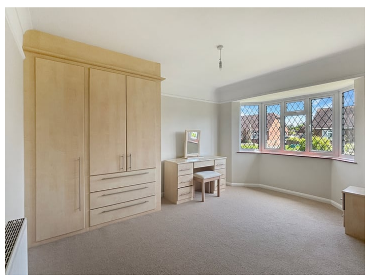
14'10'' x 11'1'' (4.5m x 3.4m) Double glazed bay window to front, radiator, fitted wardrobe and dressing table.