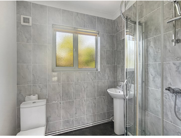
6'5'' x 5'4'' (2m x 1.6m)

Double glazed obscure window to rear, tiled walls, low level WC, wash hand basin, shower enclosure.