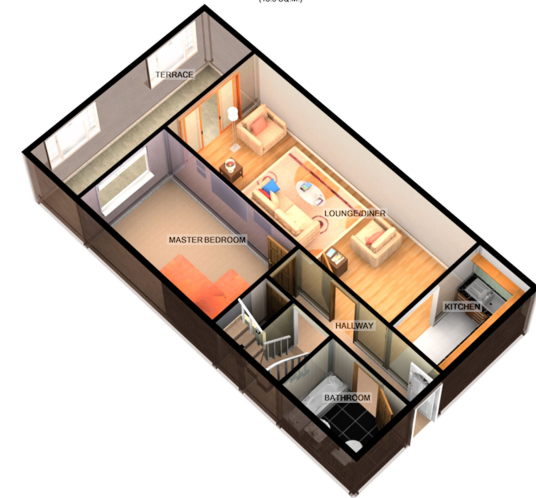
GROUND FLOOR APPROX. FLOOR AREA 658 SQ.FT. (61.1 SQ.M.)

TOTAL APPROX. FLOOR AREA 855 SQ.FT. (79.5 SQ.M.)