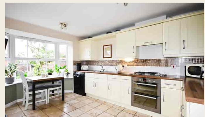
COUNCIL TAX Band F.