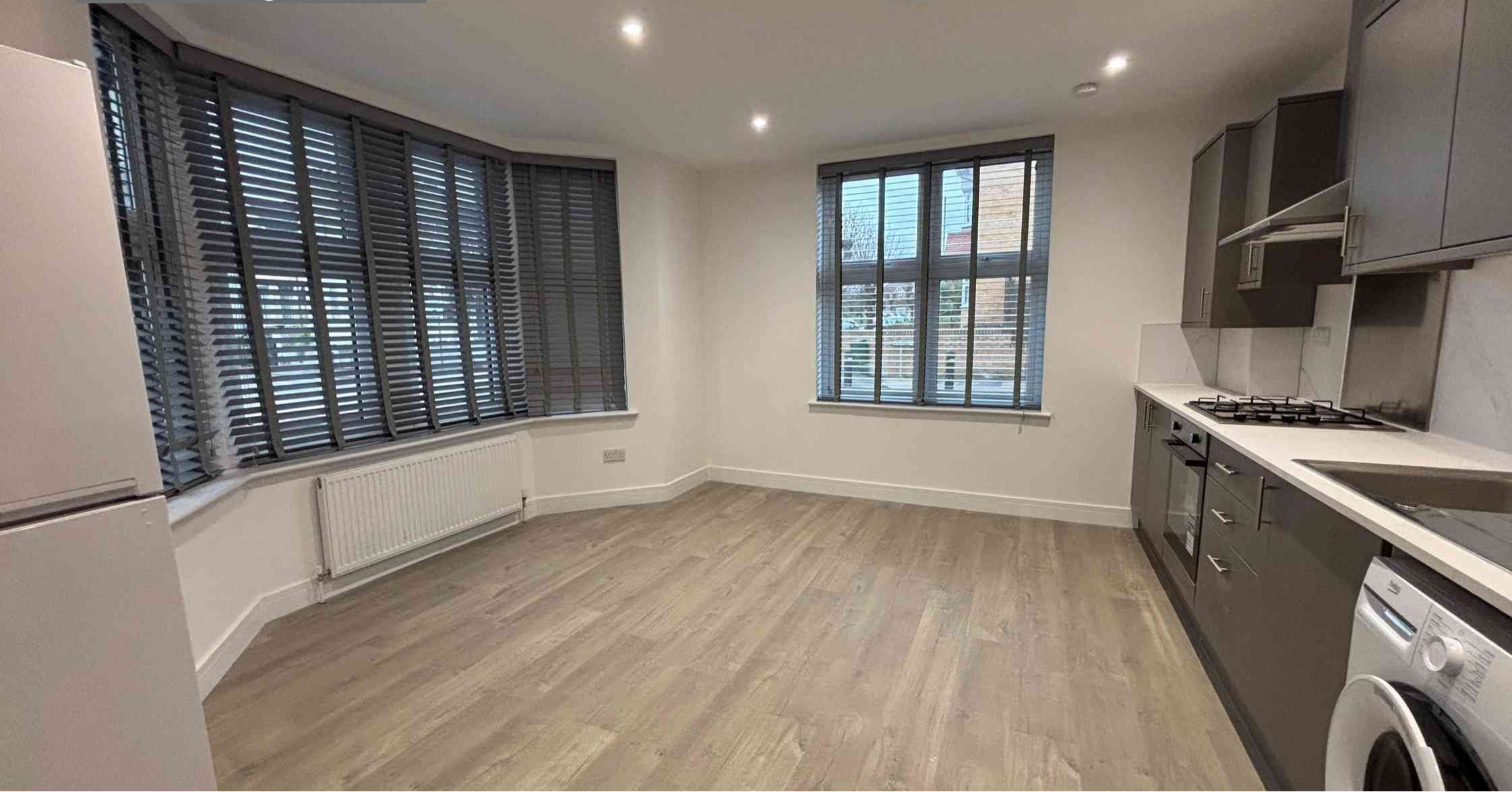
One Bedroom Apartment Rock Avenue, Kent, ME7 5PY