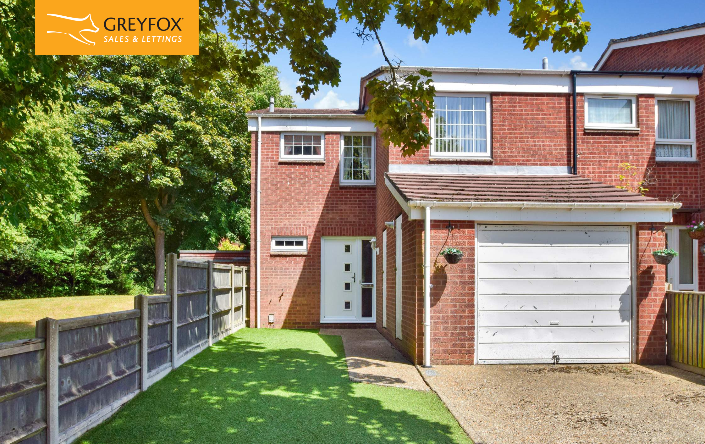
Three Bedroom End of Terrace House Kingston Crescent, Lordswood, Chatham, Kent, ME5 8YG