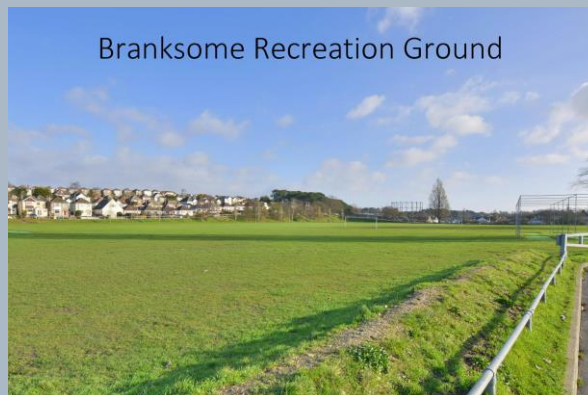
Branksome Recreation Ground