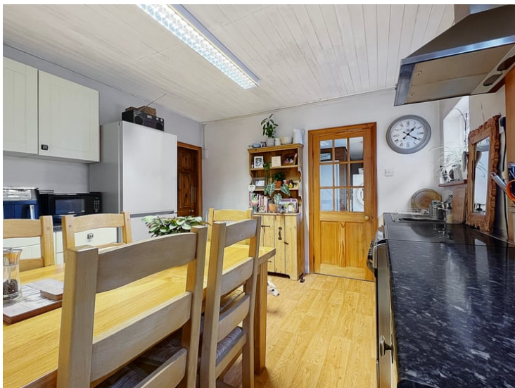
14' 0" x 11' 5" (4.27m x 3.48m)