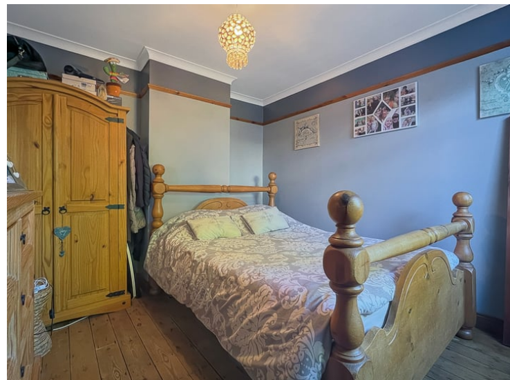
11' 4" x 10' 1" (3.45m x 3.07m)