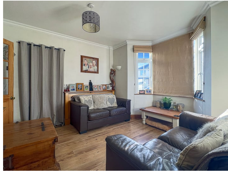
12' 9" x 11' 5" (3.89m x 3.48m)