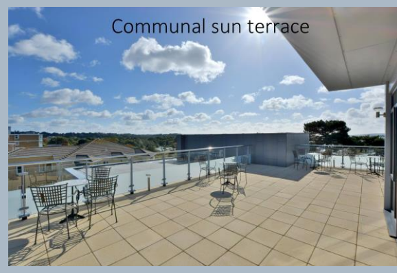
View from sun terrace