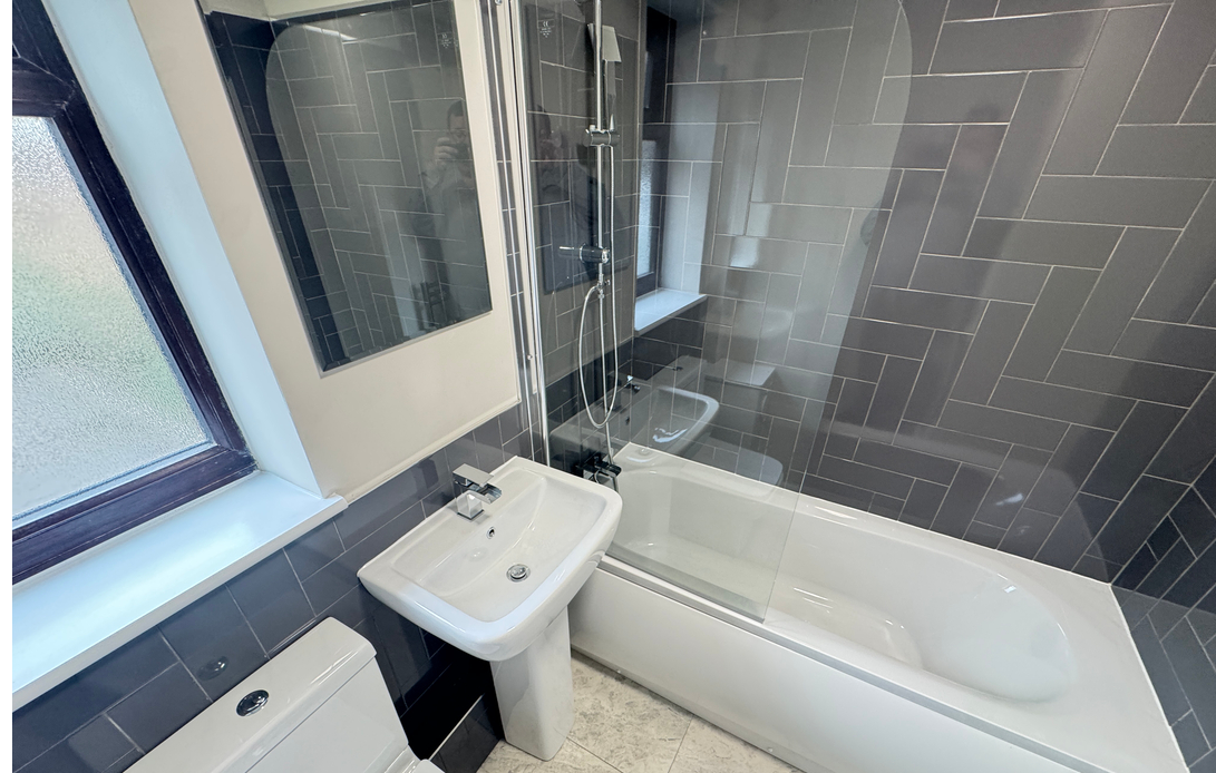
Dunstan Court, Leacroft, Staines-upon-Thames, Surrey TW18 4NX £229,950 - Leasehold