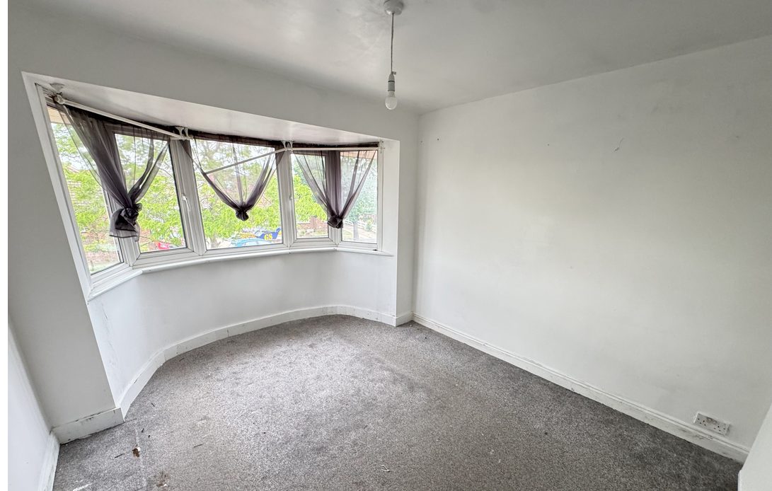
142 Clare Road, Staines-upon-Thames, Surrey TW19 7EG £295,000 - Leasehold