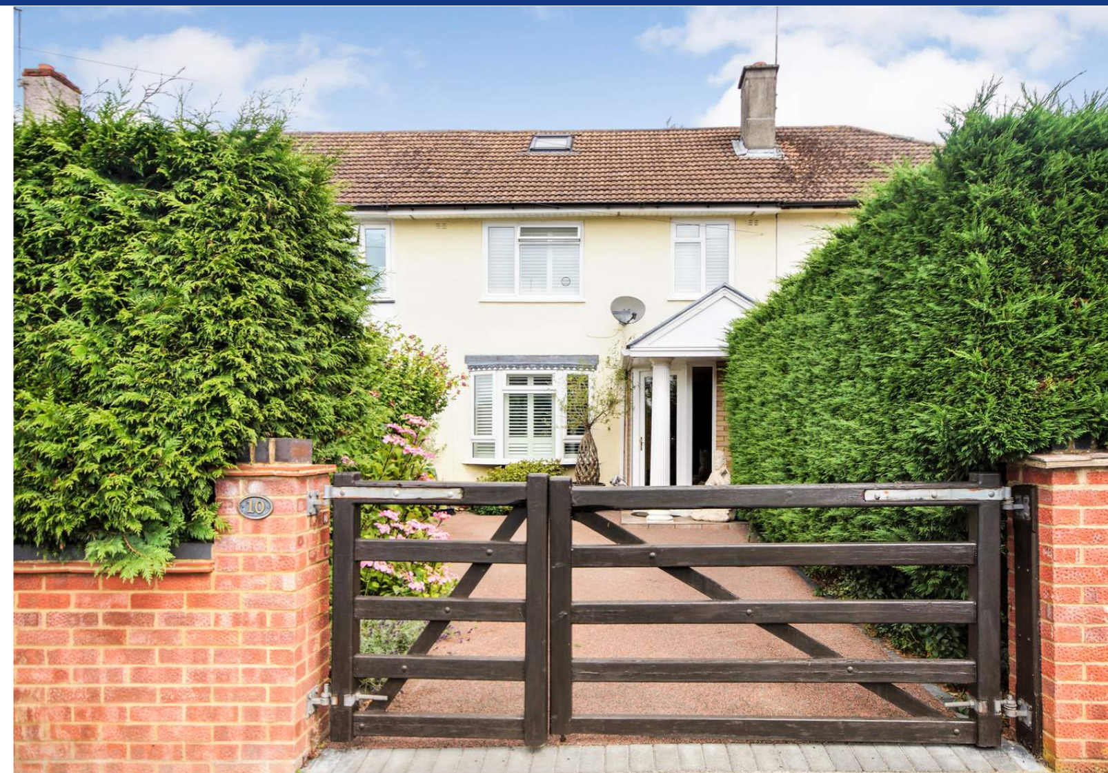
Holberton Road, Reading, Berkshire. RG2 8NL.