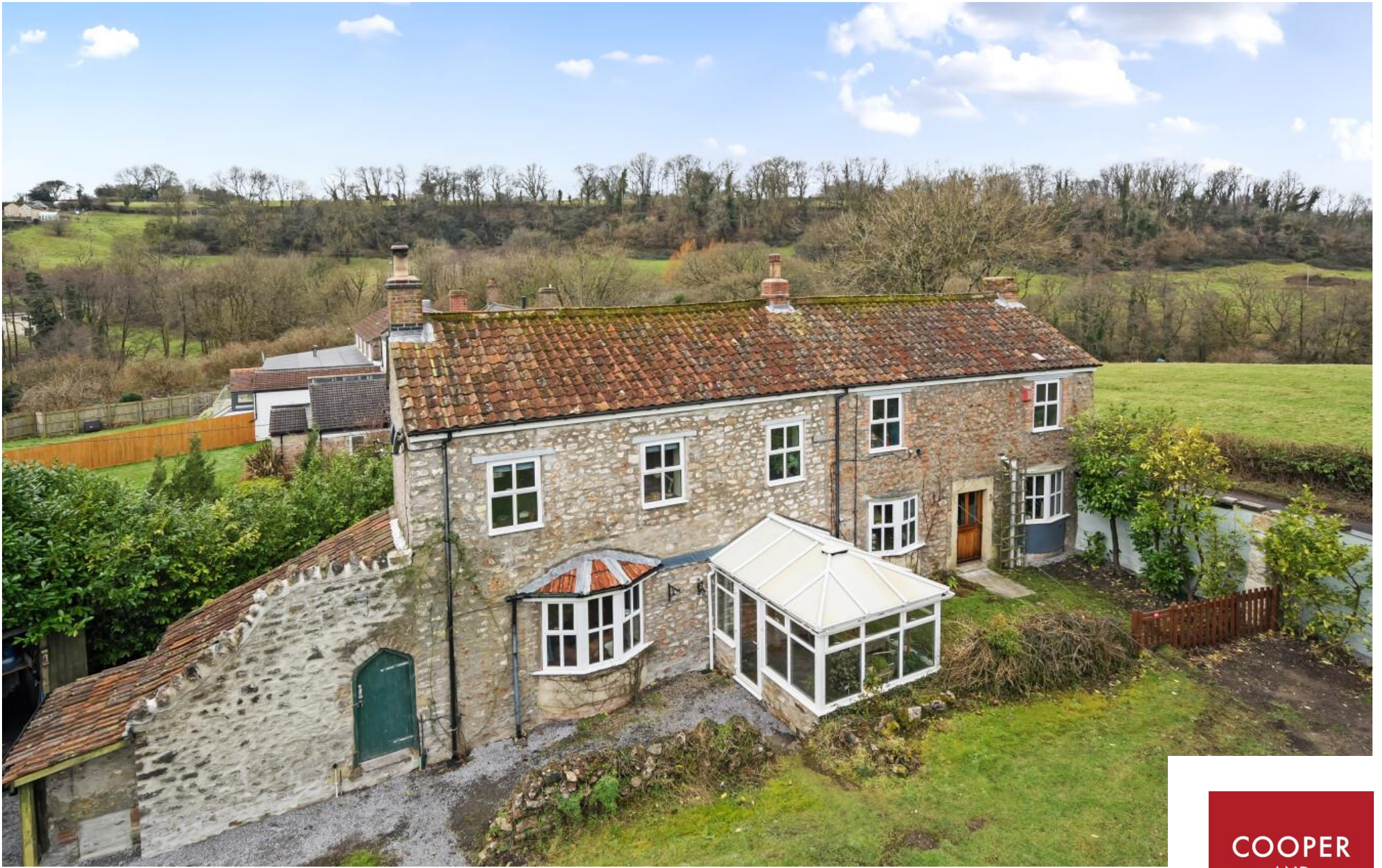
Ivy House, Nettlebridge, Oakhill, Radstock BA3 5AB