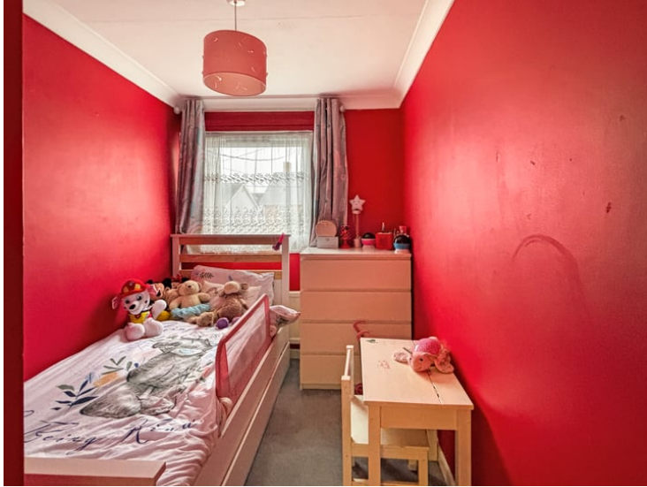
9' 1" x 6' 3" (2.77m x 1.91m) Double glazed window to front, radiator.