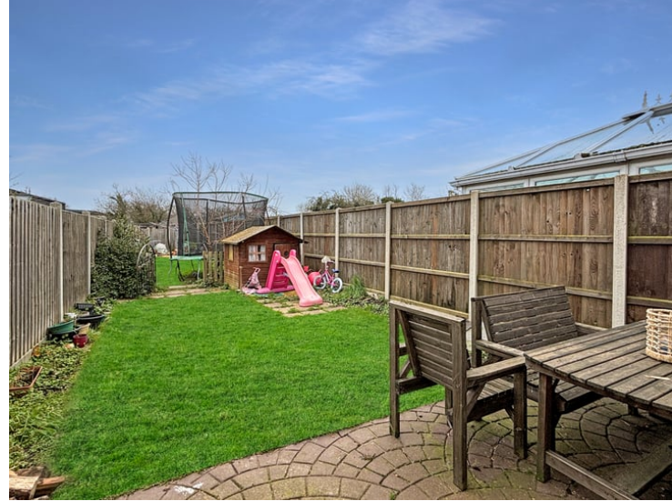
A generous rear garden, mainly laid to lawn and patio, side access, retained by fencing.