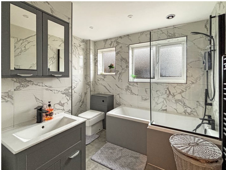
Double glazed windows to side, tiled walls, P Shaped bath with over head shower, low level WC, vanity unity.