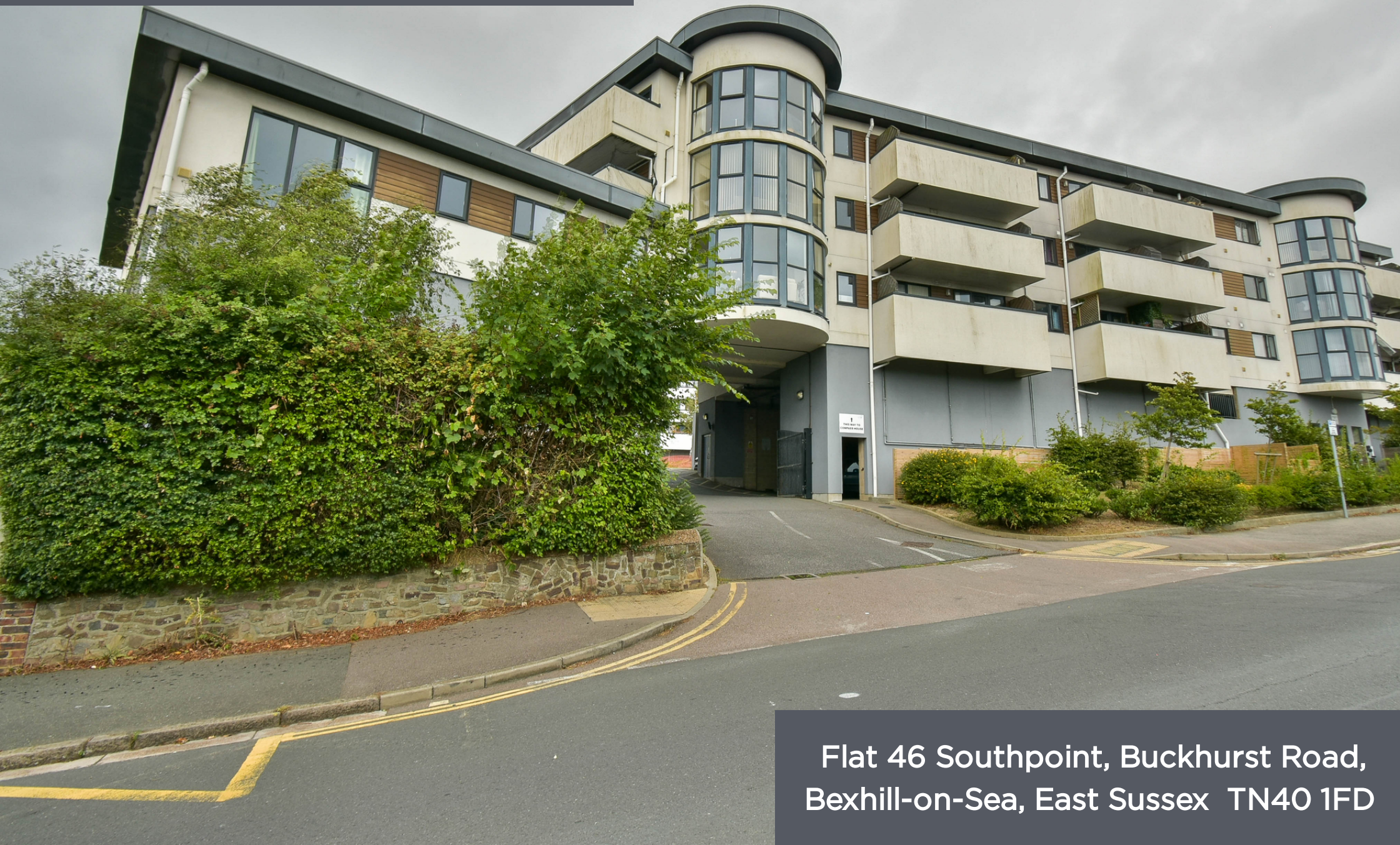
Flat 46 Southpoint, Buckhurst Road, Bexhill-on-Sea, East Sussex TN40 1FD