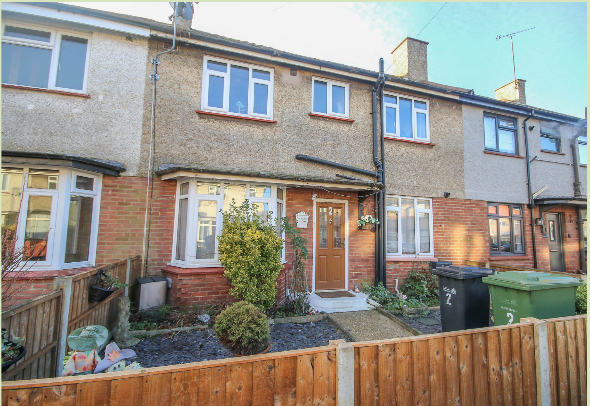
2 Methuen Avenue , Gaywood Guide Price £200,000