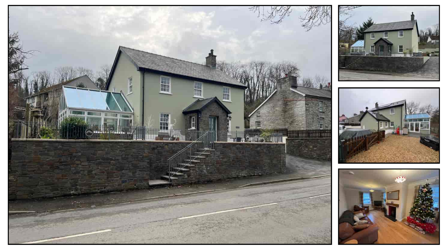
A most attractive, substantial 3 bed (2 en suite) detached residence. Standing proud over the River Teifi at Cenarth, near Newcastle Emlyn - West Wales.

Man Ar Afon, Cenarth, Newcastle Emlyn, Carmarthenshire. SA38 9JL. £365,000 Ref R/4448/ID