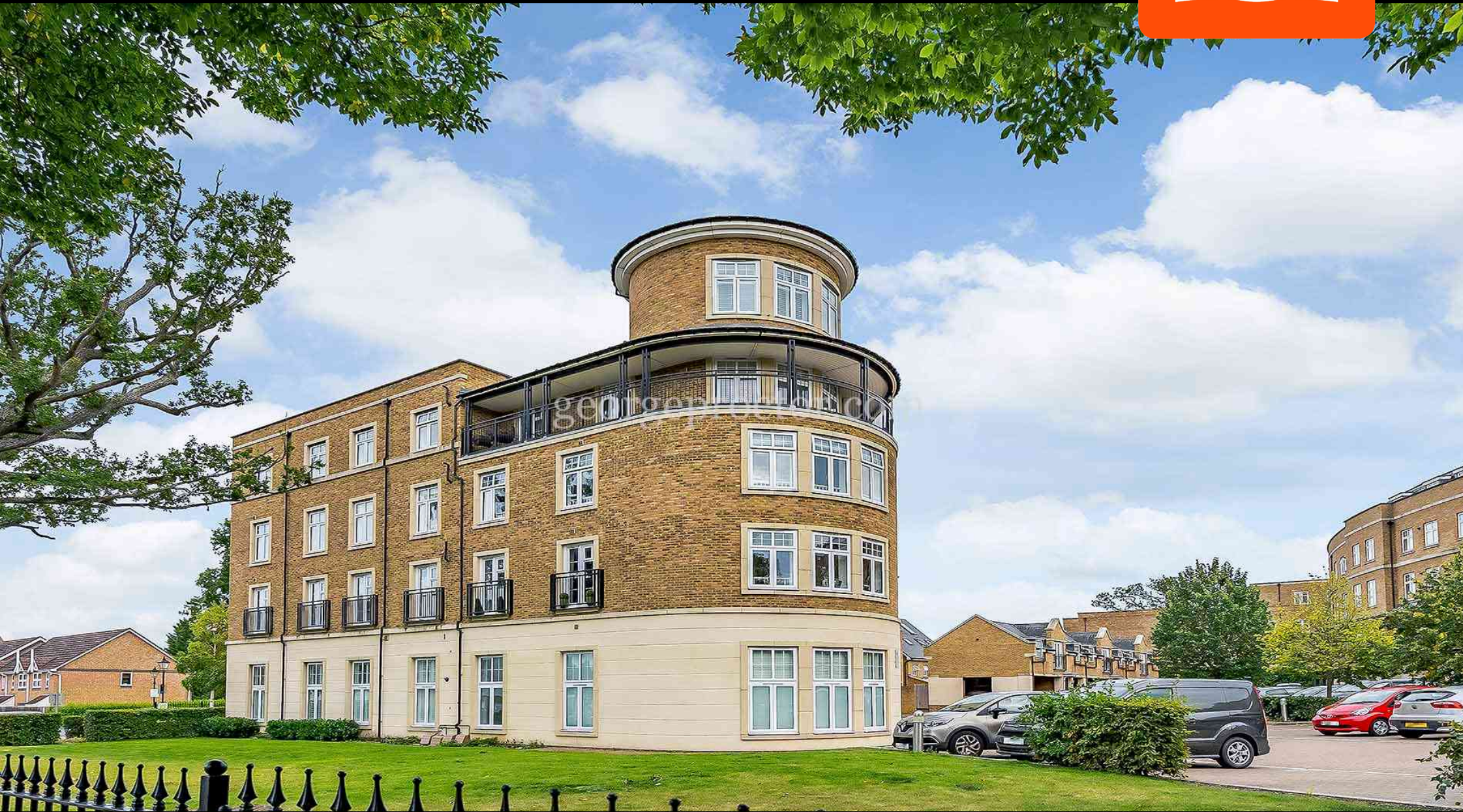
Jefferson Place, Bromley, Kent. BR2 9FX