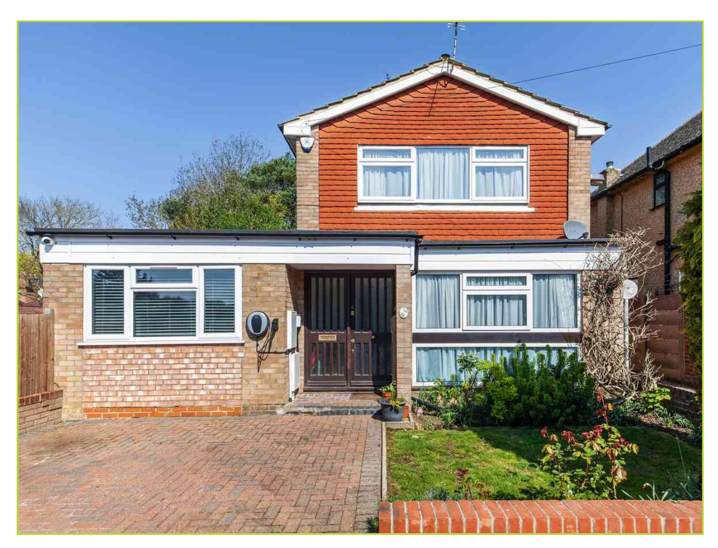
Snaresbrook Drive, STANMORE, Middlesex. HA7 4QW. £975,000 Freehold

An Extended 3/4 Bedroom Detached Bright & Airy Family Home located at the end of this popular and quiet culde-sac being a short walk to Stanmore Jubilee line station and little further to shopping amenities. The property has been extended to both the rear and side to create a superb open plan kitchen/dining area with bi fold doors overlooking well stocked gardens. The garage was converted recently to include an extra reception area/bedroom with en-suite facilities. Other benefits include off street parking for 2 cars, utility area, good sized reception room. Internal viewing is highly recommended.