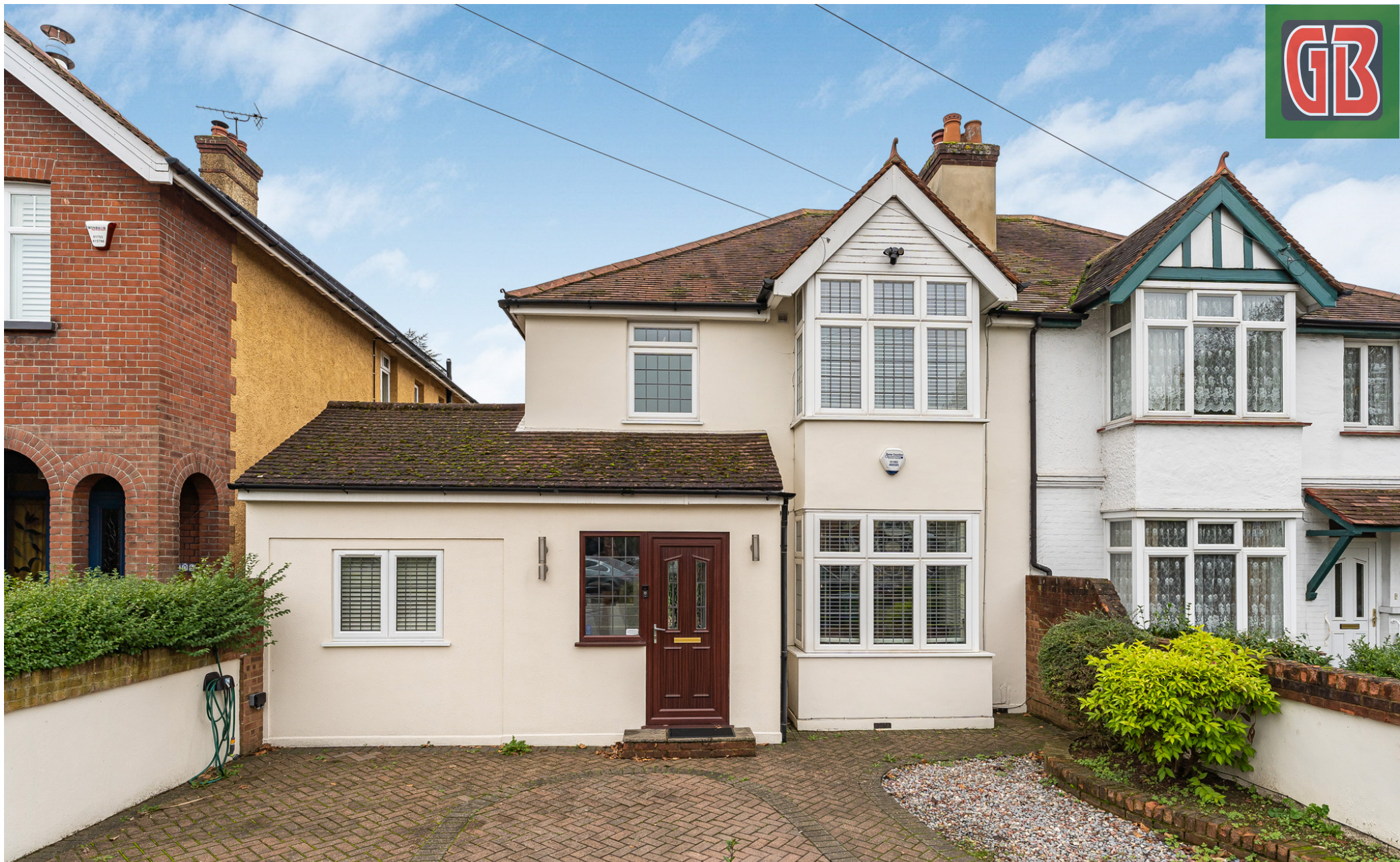
204 Kingston Road, Staines-upon-Thames, Surrey. TW18 1PE. 3 Bedroom Semi-Detached House - £650,000 Freehold