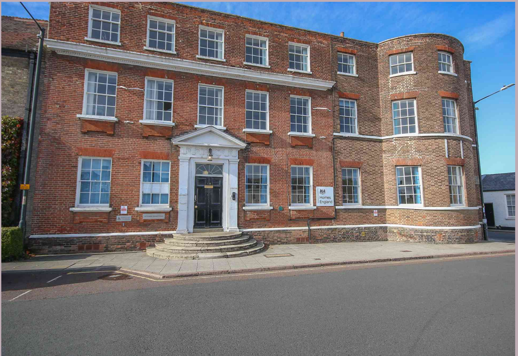
Bishops Lynn House (Office Suites), King's Lynn From £136 per calendar month