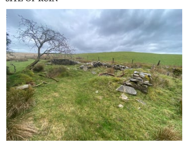
LAKE SETTING (FIRST IMAGE)