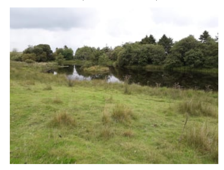
LAKE SETTING (THIRD IMAGE)