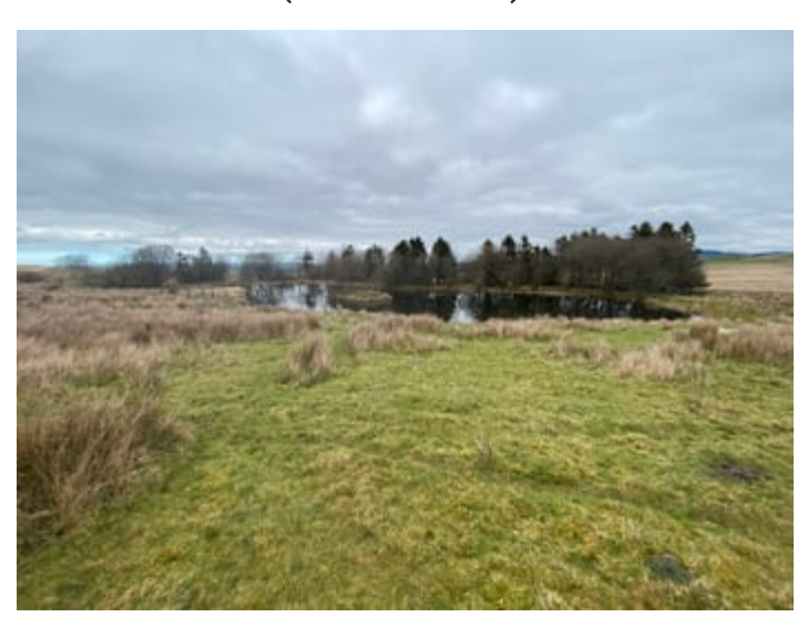
LAKE SETTING (SECOND IMAGE)