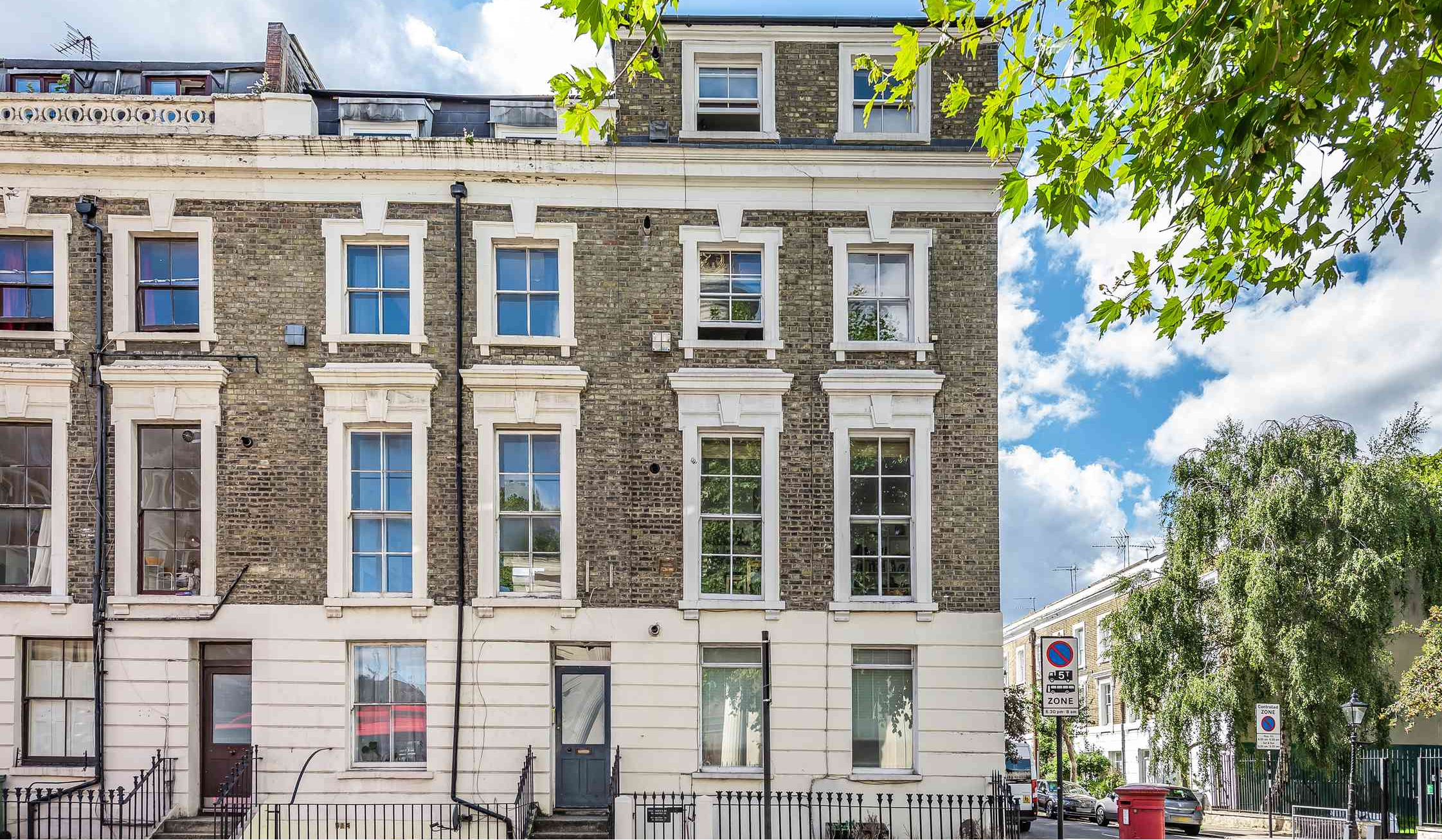
Camden Street, London, NW1 0HP