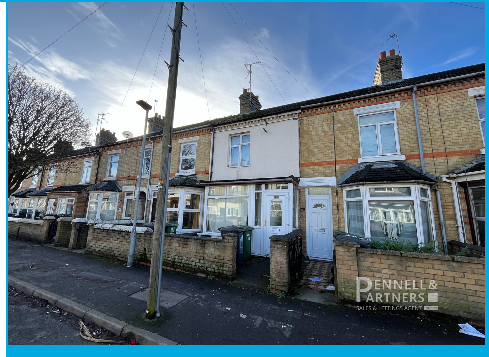
99 BELSIZE AVENUE, PETERBOROUGH, CAMBRIDGESHIRE. PE2 9HZ