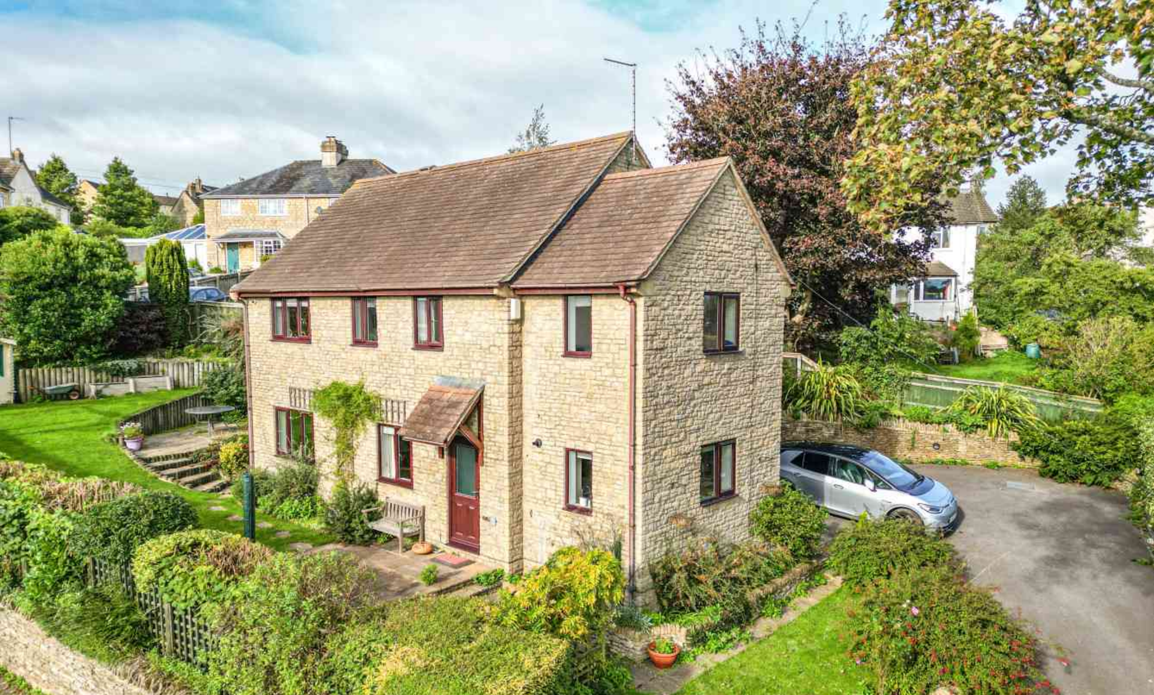
Fuchsia Cottage, Star Hill, Nailsworth, Gloucestershire, GL6 0EY £625,000