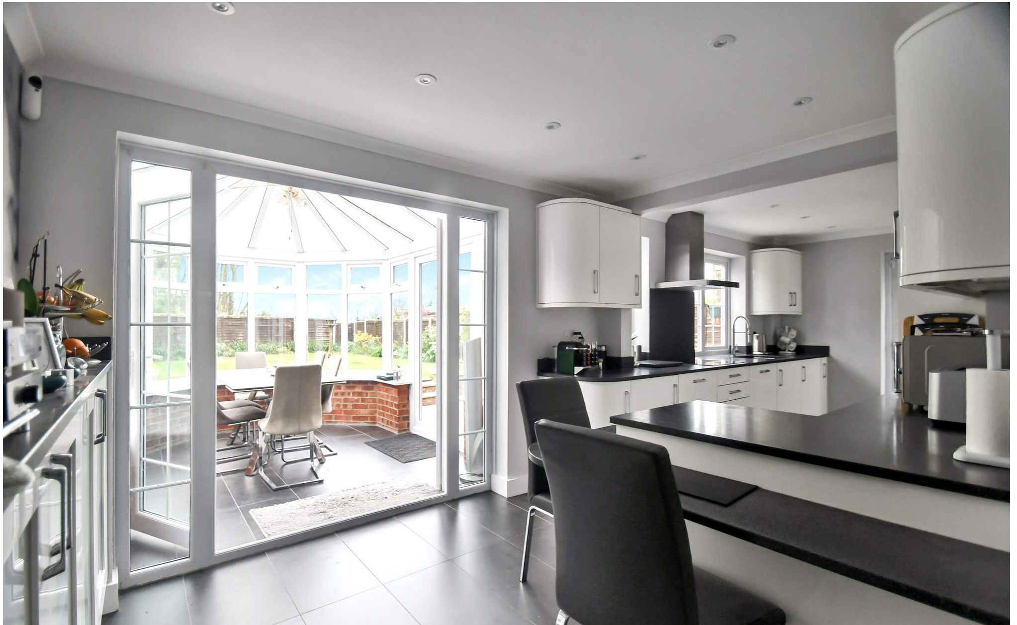
GLENWOOD CLOSE, HEMPSTEAD, GILLINGHAM, KENT, ME7 3RP