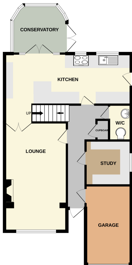
GROUND FLOOR 814 sq.ft. (75.6 sq.m.) approx.