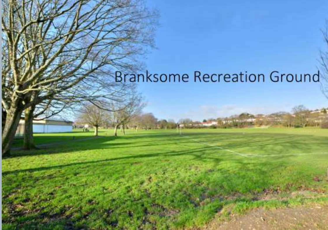
Branksome Recreation Ground