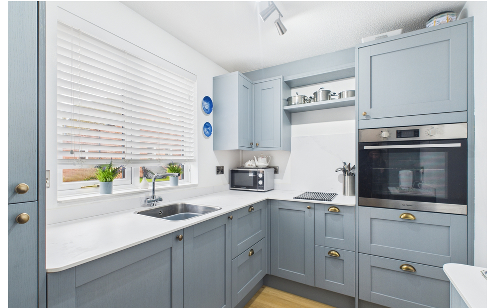
Flat 15 Meadow Court, Bridge Street, Belper, Derbyshire DE56 1HE £185,000 - Leasehold